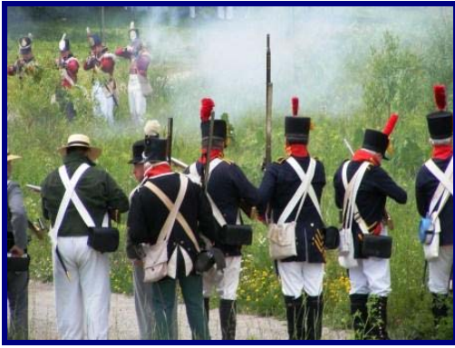
Point blank range! Marine Heritage Festival Port Dover