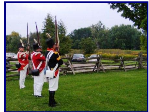
Rifle demonstration Lang Pioneer Village