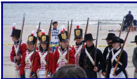
Student Re-enactment Cobourg

In 2006, the Ontario government, through the Ministry of Tourism, determined that a commemoration of the 200th anniversary of the War of 1812 would be beneficial for Ontario and as a result, designated six Ontario regions to "receive support funding to plan and execute bicentennial legacy projects...". Although it is still a little less than a year and a half before 2012, War of 1812 Celebration plans are well underway in all six regions. The Celebrations won't be limited to just 1812, because the war actually lasted until 1815, so Celebrations will continue until 2015. In this newsletter, we hope to keep you informed throughout the next few years about planned activities both now and in the future and to offer you articles that will help you get to know more about Canada's history and our wonderful relationship with our friends to the south. Although it was a relationship that didn't start off too well, it is now one that is the envy of the world! This newsletter will be published 4 times per year ( quarterly ), summer, fall, winter and spring. We always welcome comments and suggestions.