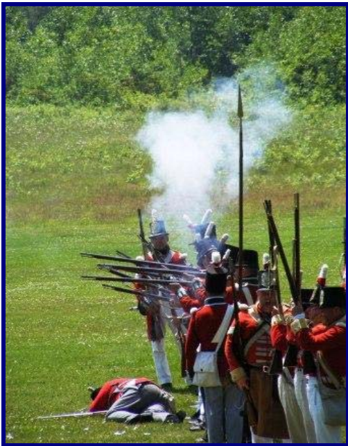
Thin Red Line Military Re-enactment Upper Canada Village