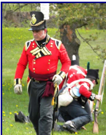
Surveying the field Battle of Longwoods