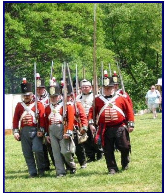
Marching to battle Battle of Stony Creek