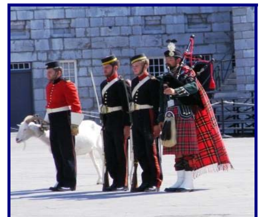
On Parade Fort Henry