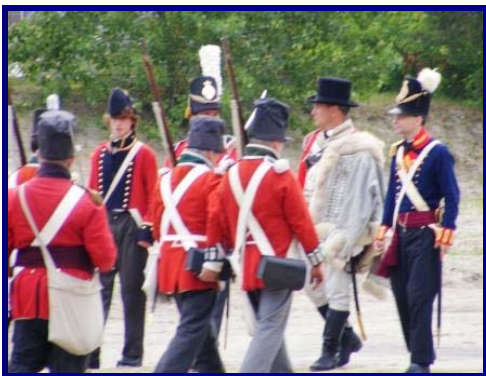
Inspection Wasaga Under Siege

Ontario Festivals Visited P.O. Box 272 Cobourg, Ontario K9A 4K8 Canada Telephone: (888) 818-0255 E-Mail: info@ontariofestivalsvisited.ca